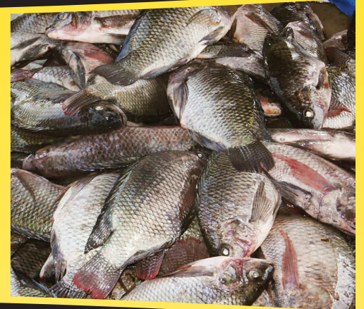
The 4 Prioritised Enterprises for Accelerated Wealth Creation in Bukedi Sub Region